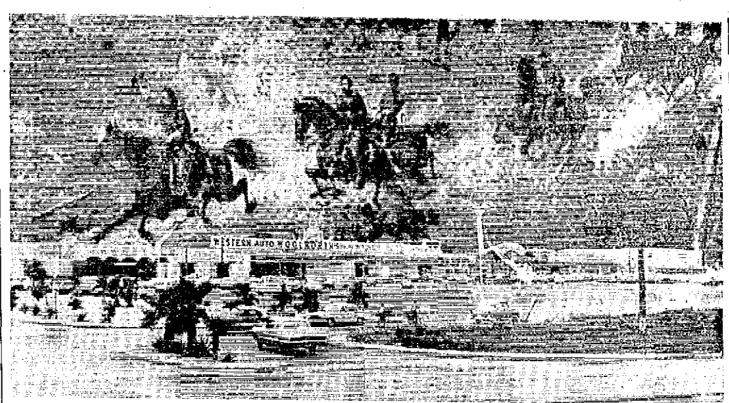
THE CUSTOMER WINS, whether the South rises again or the North falls by the wayside, McCreless Shopping City is at war . . . a price war, that is and only the customer will benefit at this fun-filled, war-like promotion event!